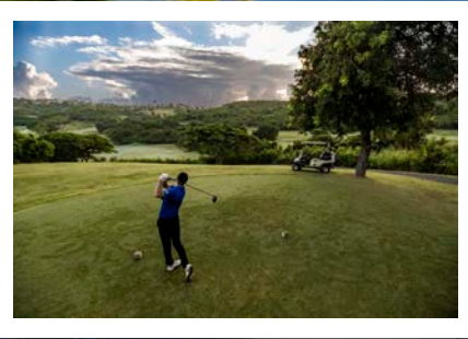
Onsite 18-Hole Golf Course

Your Puerto Rico Trip Includes Airfare and Luxurious Accommodations for Two At A Paradise Oasis On Puerto Rico's Tranquil East Coast!