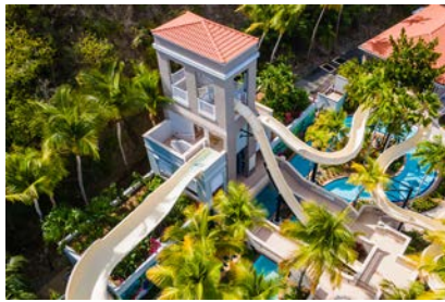
Onsite Water Park Will Keep Kids Busy All Day