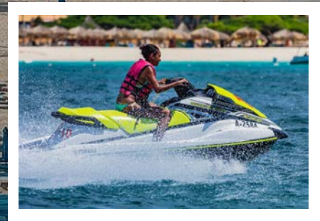
Rent Boats, Jet Skis, Paddleboats & Kayaks