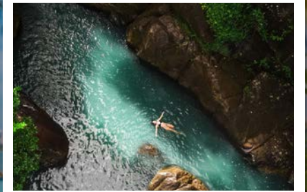
Minutes from the Only Rainforest in the USA