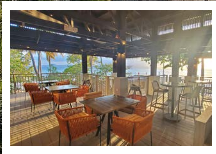
Onsite Full Service Restaurant & Bar

Relax on the powdery white sand beaches of Palomino, El Conquistador's 100-Acre private island!